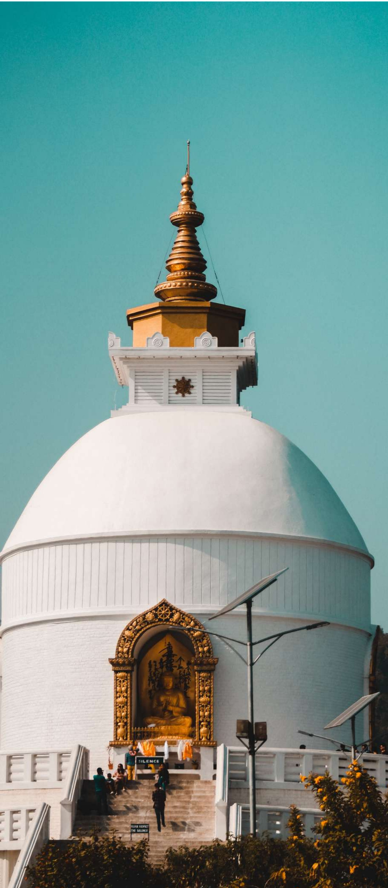
World Peace Pagoda, Lumbini

Day 07, Pokhara - Early morning excursion to Sarangkot to witness sunrise over the Annapurna range. The panoramic view of the Himalaya seen from this point is superb. Afternoon sightseeing of Pokhara and visit Phewa Lake. Here, you can sail or row a hired boat across the water, and visit the old and traditional bazaar. (B)