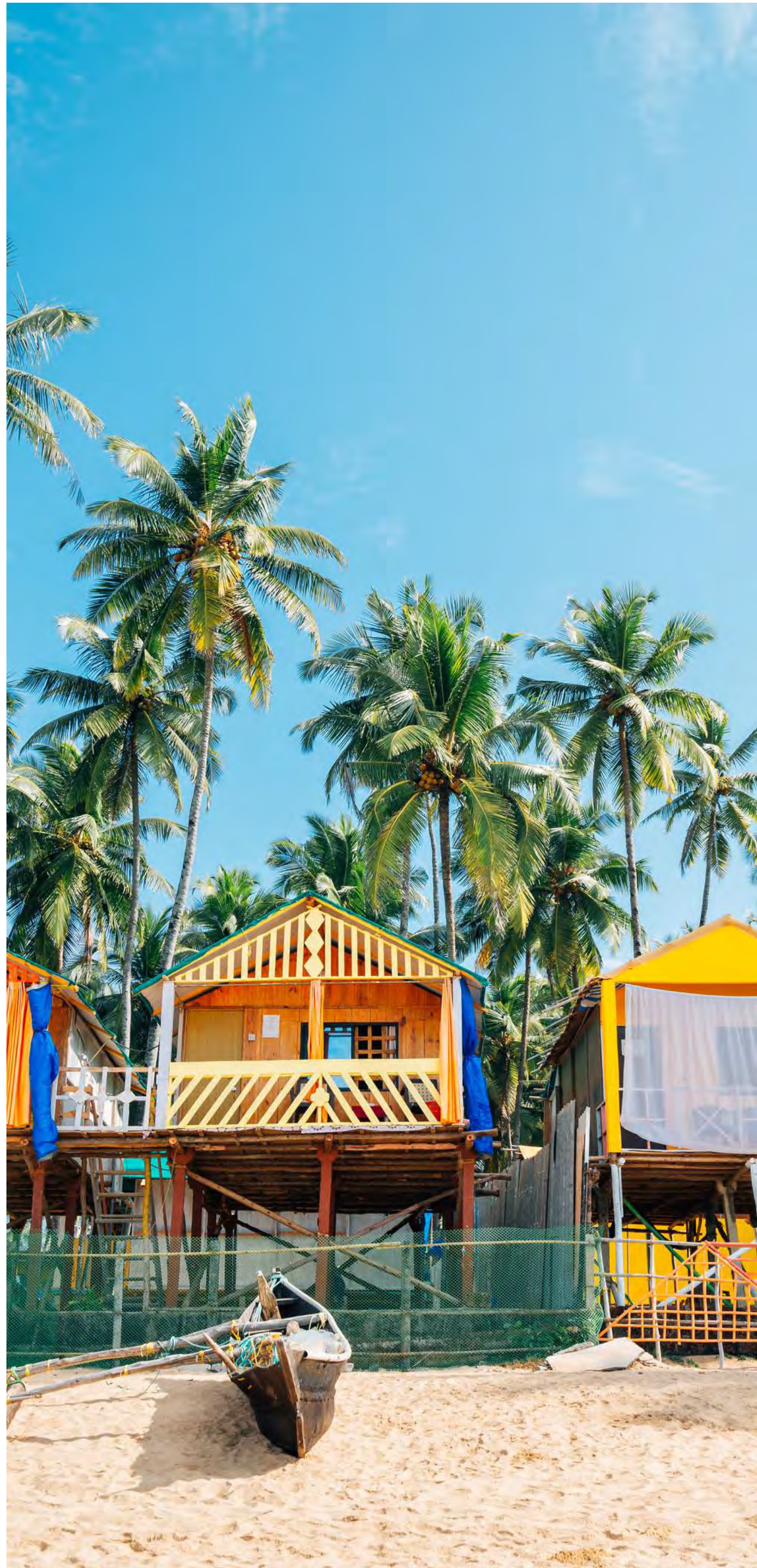
Candolim Beach, Goa

INCLUSIONS: Meet & greet service on arrival, welcome document kit, private round trip transfers airport /hotel, accommodations as described (or similar) on twin sharing basis, daily buffet breakfast, transportation by air-conditioned vehicles, sightseeing and excursions as described, entrance fees to sites visited, services of professional English-speaking guides, hotel taxes & service charges, and all currently applicable taxes and applicable domestic flights as per itinerary inclusive of taxes & fees. *Domestic airfare and related taxes are not guaranteed until flight tickets issued.