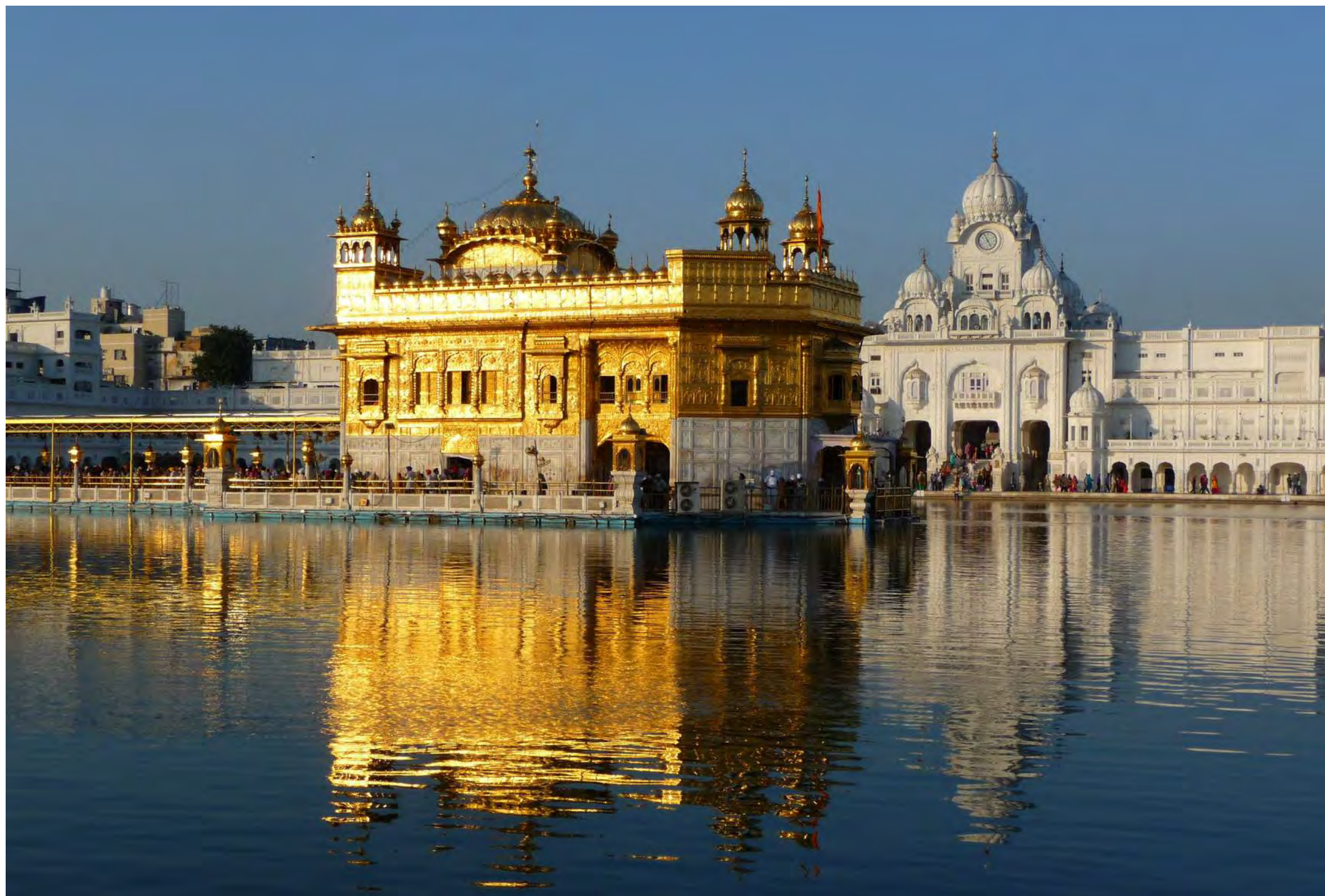
Golden Temple, Amritsar

INCLUSIONS: Meet & greet service on arrival, welcome document kit, private roundtrip airport/ hotel transfers, accommodations as described (or similar) on twin sharing basis, daily buffet breakfast, transportation by air-conditioned vehicles, sightseeing and excursions as described, elephant or Jeep ride in Jaipur, entrance fees to sites visited, services of professional English-speaking guides, hotel taxes & service charges, train fare from Delhi to Amritsar in air-conditioned chair car class and applicable domestic flights as per itinerary, inclusive of taxes & fees, and all currently applicable taxes.