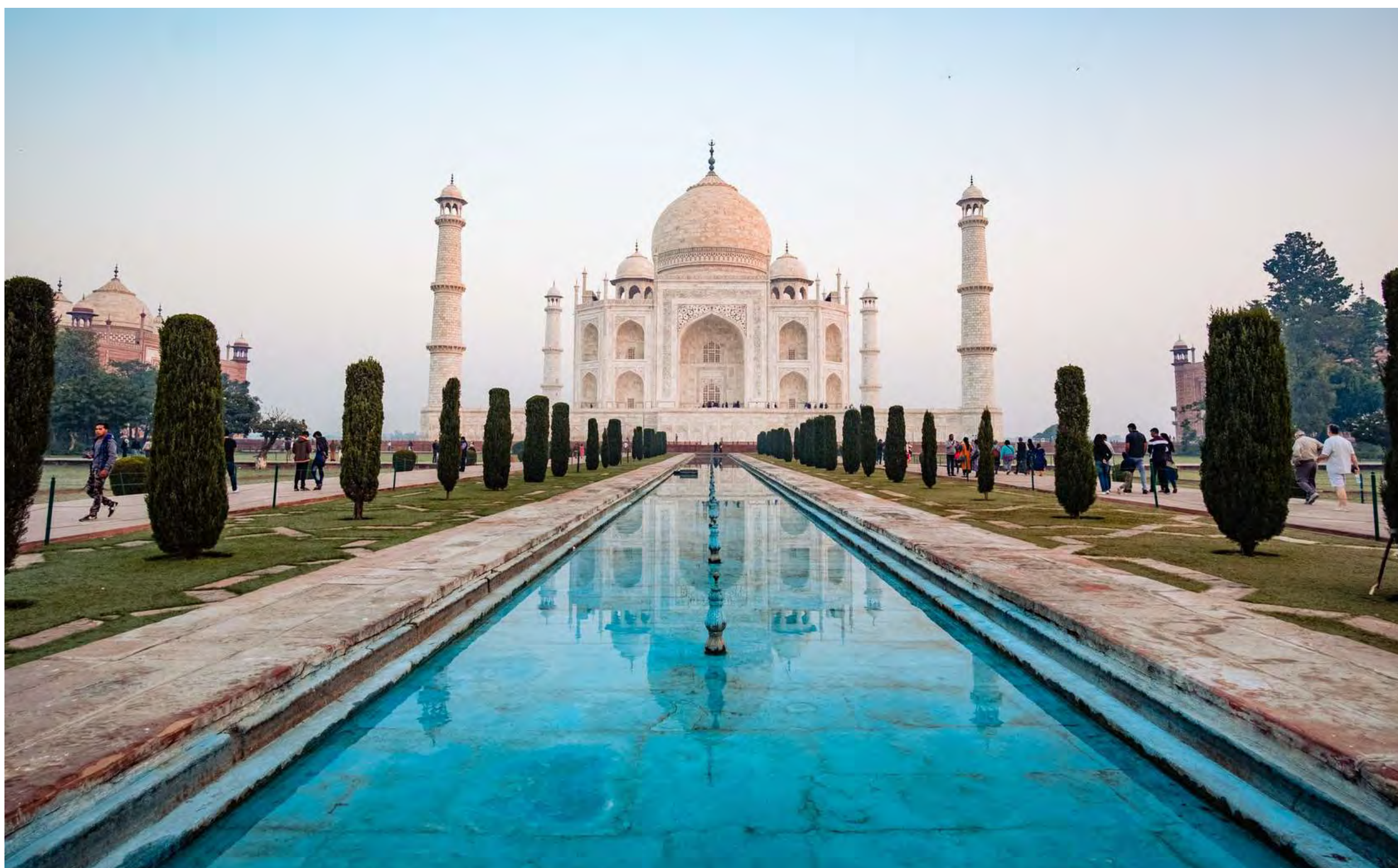
The Taj Mahal, Agra

Day 01, Arrive Delhi - A warm welcome on arrival at the airport by our representative and transfer to hotel.