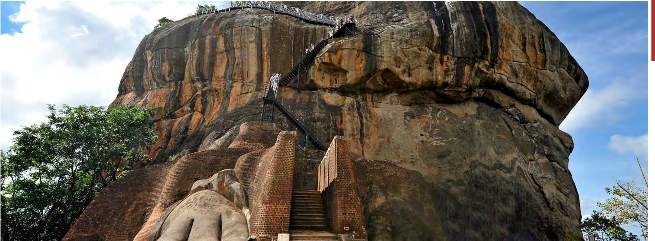
Sigiriya Rock Fortress

Day 1, Arrive Colombo/Negambo - Arrive Bandaranaike International Airport, meet & greet service and transfer to Negambo. Check in at the hotel. Day at leisure. Overnight.