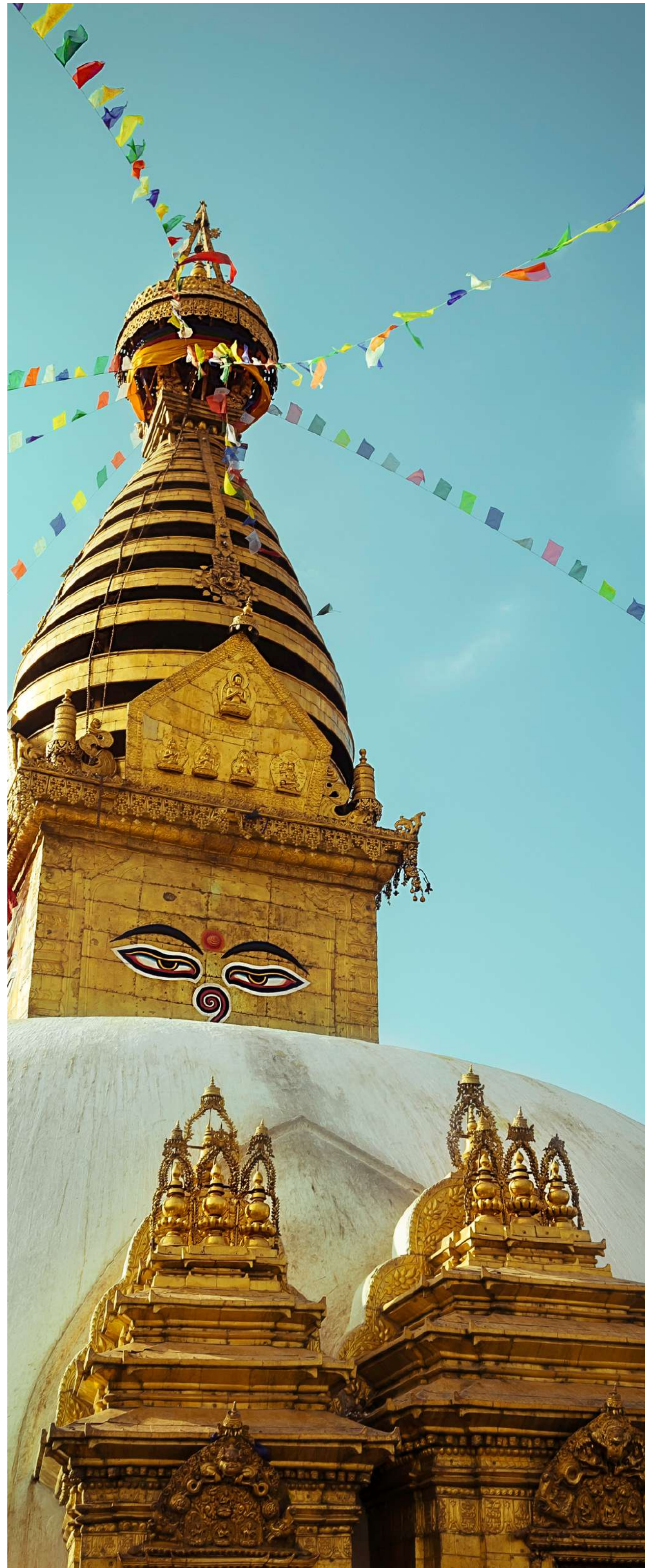
Swayambhunath Stupa, Kathmandu

Day 06, Lumbini - Pokhara (drive 280 km / 8 hrs.) Today, drive to Pokhara, an enchanting city nestled in a tranquil valley, and a place of remarkable natural beauty and history. (B)