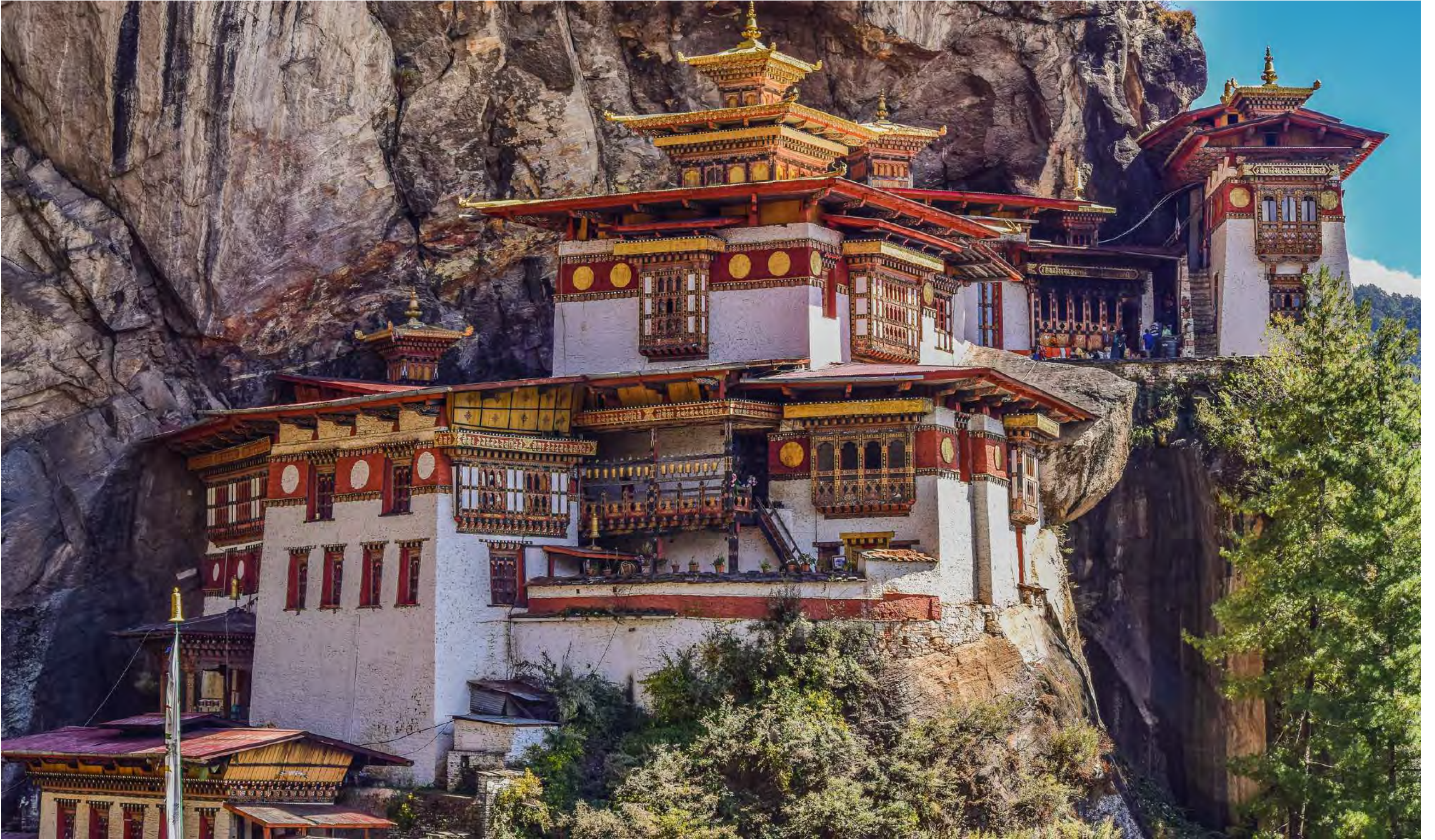
Tiger Temple, Lhasa

Day 1, Arrival in Paro / Thimphu (approximately 2 hr. drive) — On a clear day, even before your flight begins its descent into Paro, the panoramic views of the Himalayas, including Mt. Everest, are stunning as you fly over the Bhutanese foothills and land at the tiny airstrip of Paro. Upon arrival at Paro airport, meet and greet service by our local representative/guide and a drive to Thimphu. Thimphu is relatively small having a population of approximately 90,000 people and the streets are wide and tree lined. There are a good many things to see in the capital which has a very relaxed, laid-back feel about it. (LD)