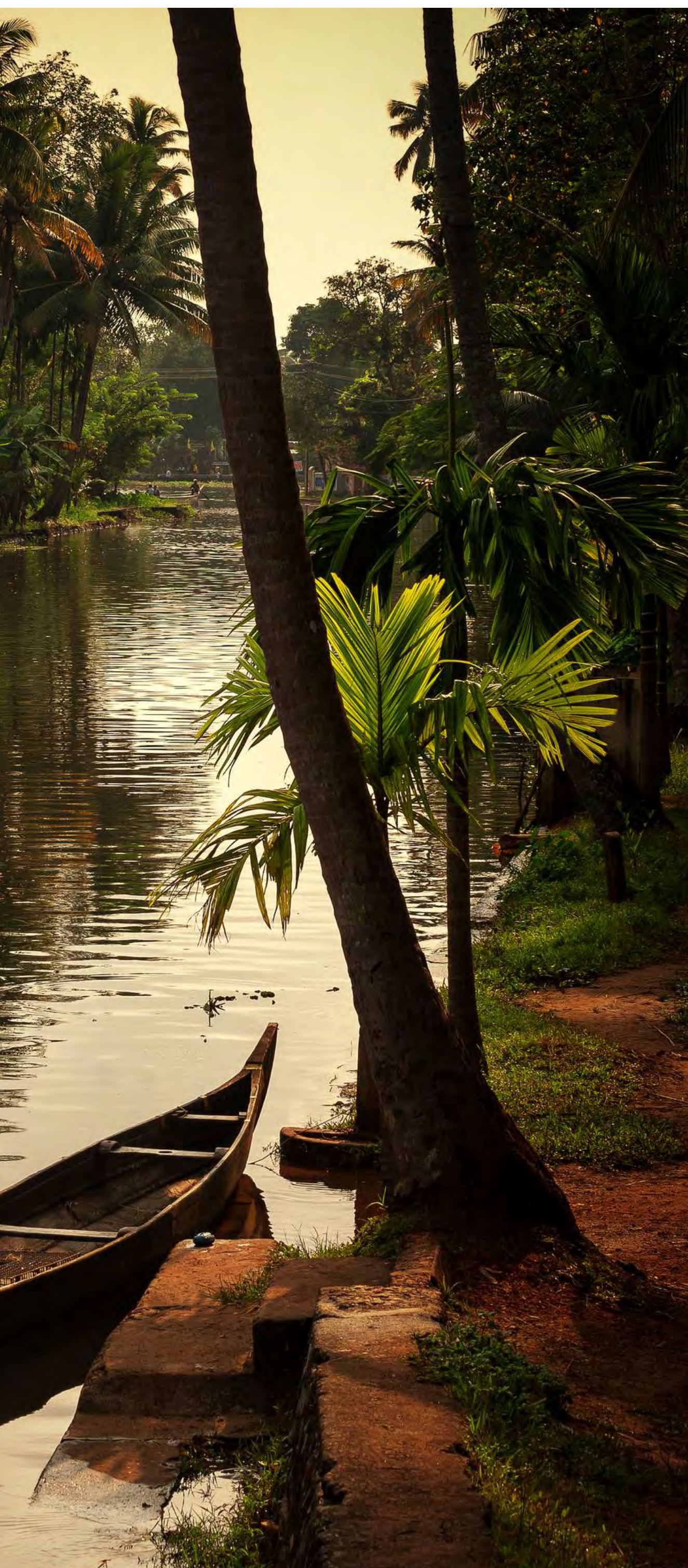
Kerela Backwaters, Allepey

Day 09, Alleppey / Kovalam - After breakfast, drive to Kovalam. Assistance on arrival in Kovalam and check in at a beach resort. Rest of the day free. Overnight (B)