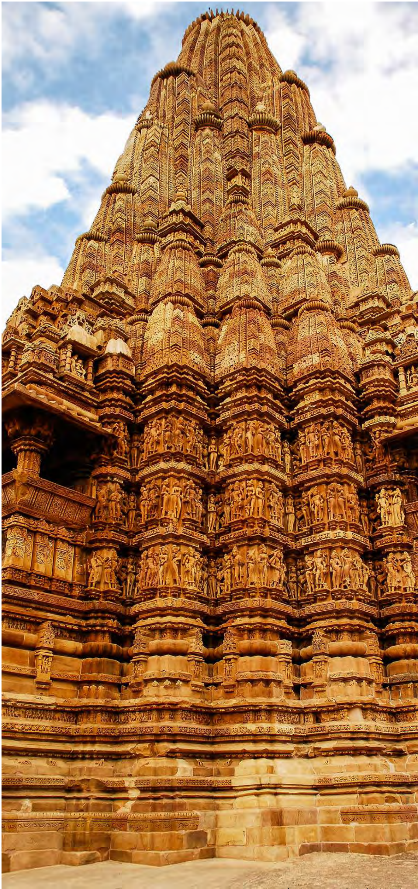
Kandariya Temple, Khajuraho

INCLUSIONS: Meet & greet service on arrival, welcome document kit, private round-trip airport/hotel transfers, accommodations as described (or similar) on twin sharing basis, daily buffet breakfast, transportation by air-conditioned vehicles, sightseeing and excursions as described, elephant/ Jeep ride in Jaipur, safari in national parks, train fare from Ranthambhore to Bharatpur and Agra to Jhansi, entrance fees to sites visited, services of professional English-speaking guides, hotel taxes & service charges, and all currently applicable taxes and applicable domestic flights as per itinerary inclusive of taxes & fees.