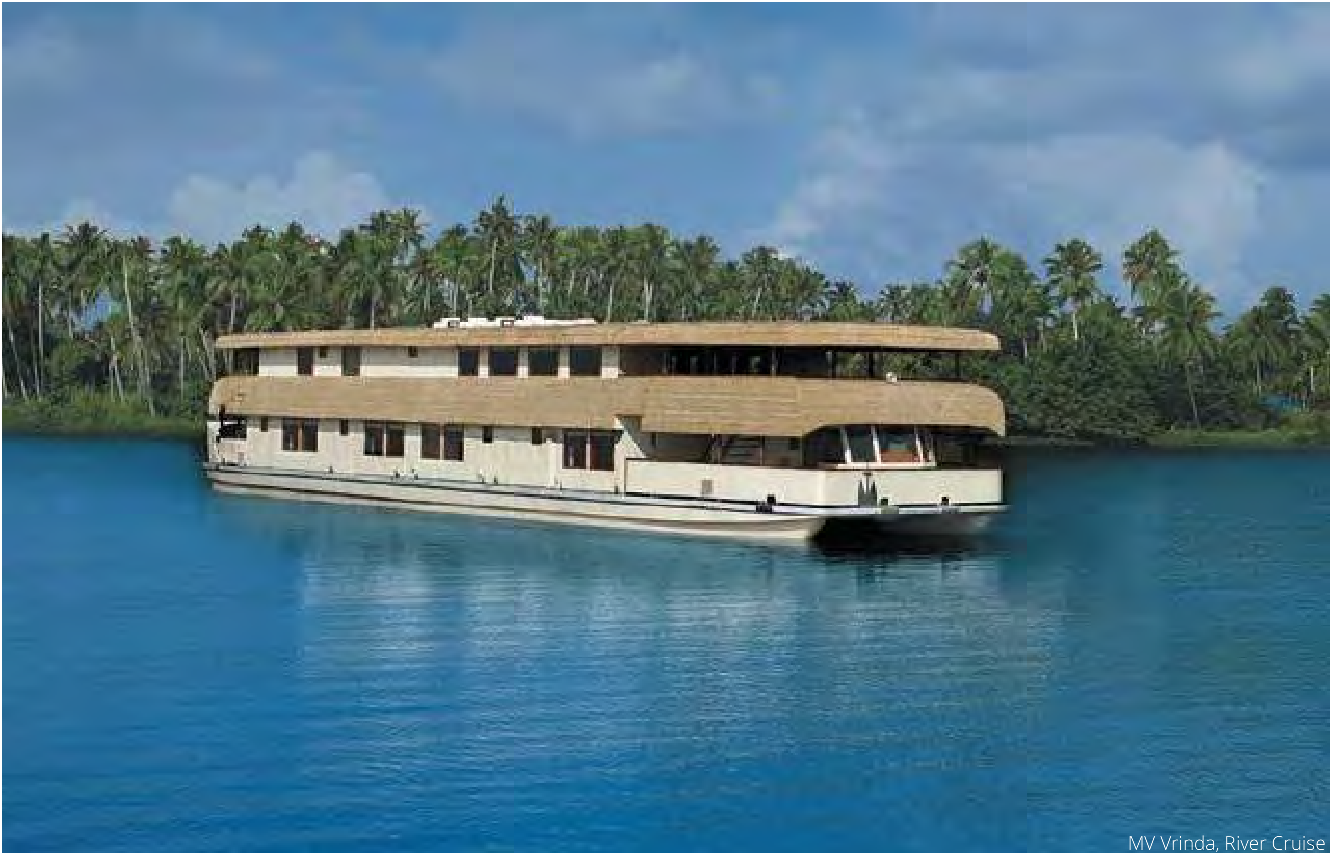
MV Vrinda, River Cruise

M/V Vrinda River Cruise (3 Days) - Operated by Oberoi Hotels, the ship sails along the main waterway on Vembanad Lake. An opportunity to interact with local fishermen, enjoy "Kathakali" dance performances which tells stories from the ancient Hindu epics and explore the few areas in the world where farming is done below sea level.