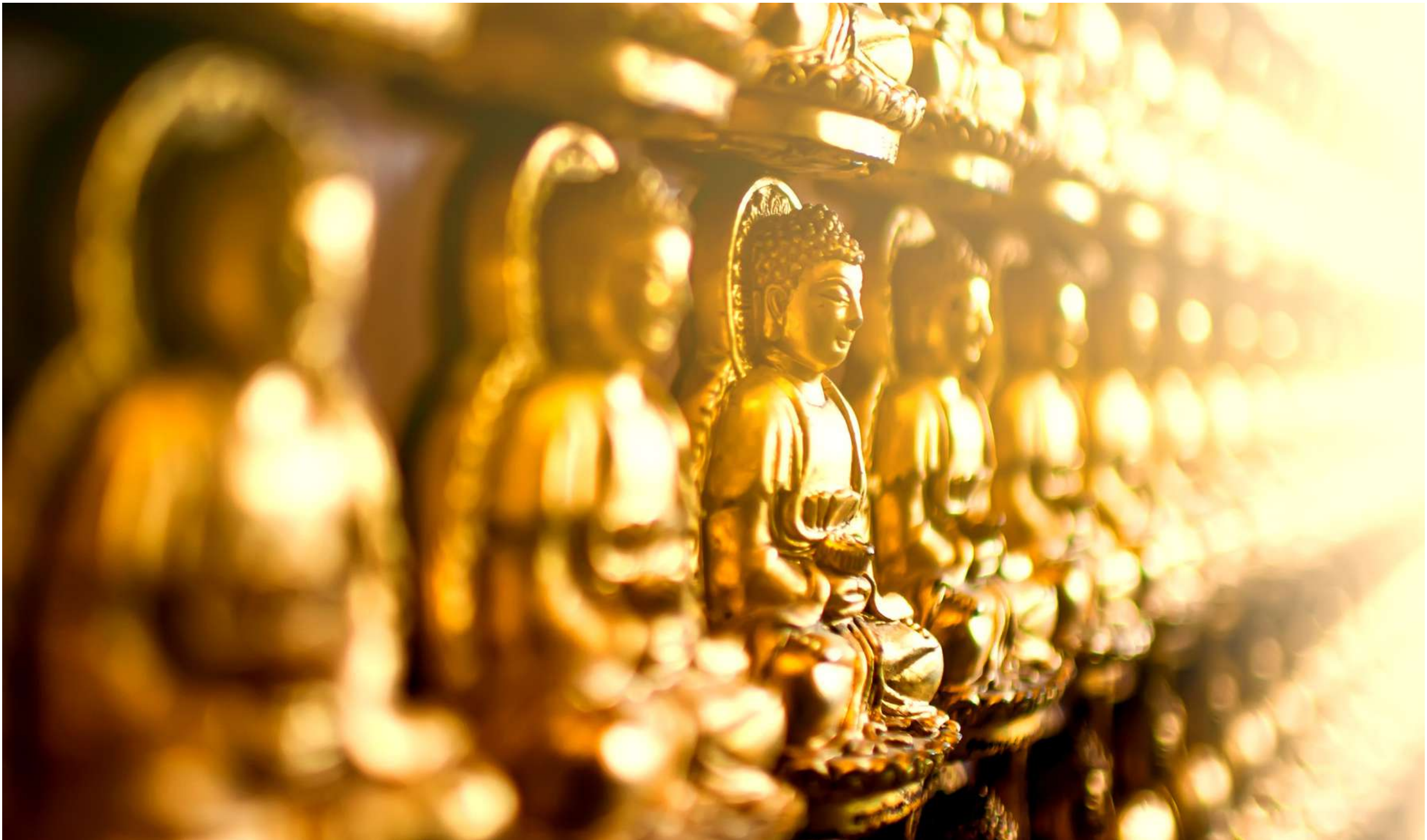
Typical Tibetan Temple

INCLUSIONS: Meet & greet service on arrival, welcome document kit, private round trip airport/hotel transfers, accommodations as described (or similar) on twin sharing basis, all meals when in Bhutan, transportation by non-air-conditioned vehicles, sightseeing and excursions as described, entrance fees to sites visited, services of professional English-speaking guides, hotel taxes & service charges, and currently applicable taxes.