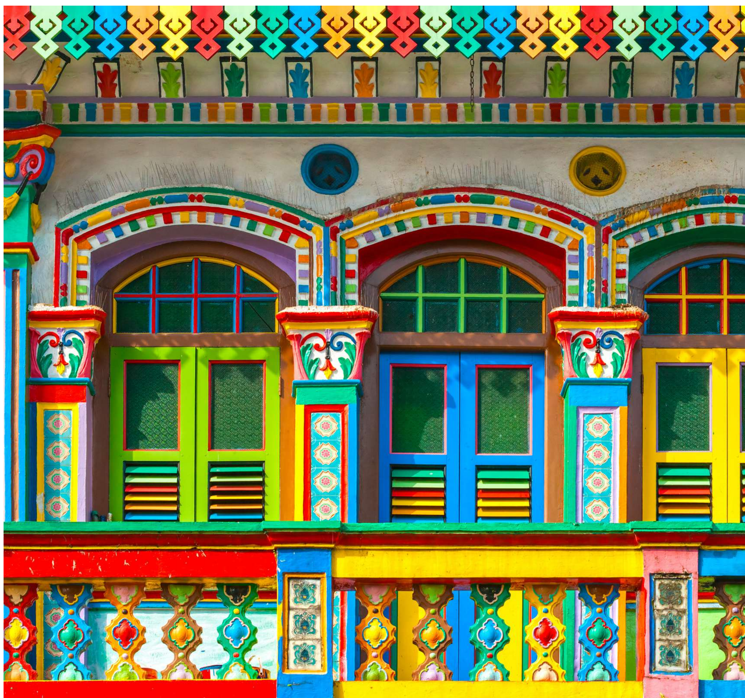
Windows of Jaipur

India is vast, diverse and distinctly different with a five-thousand-year history. On display in her cities, towns and villages are treasures of art, architecture, traditions, customs and rituals. India's multifaceted religions and her colorful mosaic of festivals are living testimony to the harmonious existence of its people. Welcome to a marvelous mystical world.