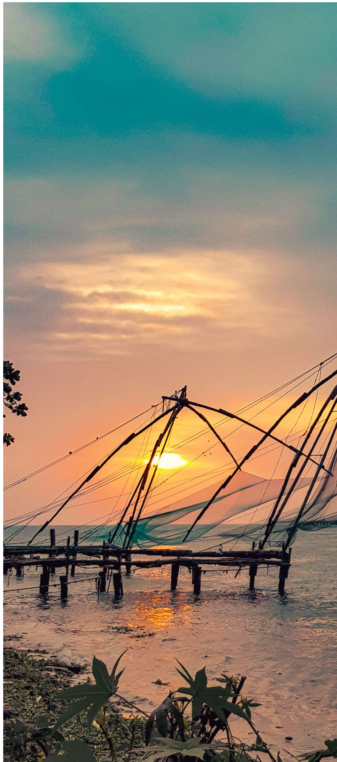
Chinese fishing nets, Cochin

Day 08, House Boat / Alleppey (Homestay) - After breakfast, disembark at Alleppey and stay at an Indian home. Alleppey has a large network of canals the meander through the town. It is famous for its backwater resources boat race, country boats, houseboats, coir product and different types of fish. The evening is designed to give you a 'feel' and insight into Indian family life as well as experience typical Indian hospitality and home-made Indian food. Overnight. (BD)